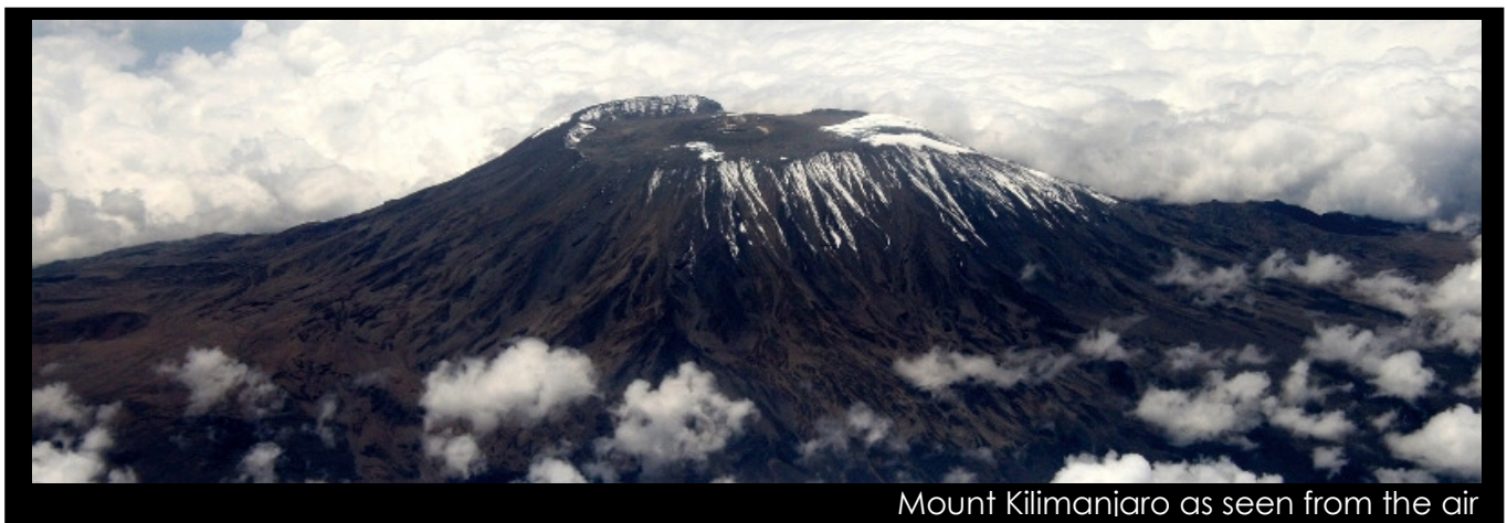
Mount Kilimanjaro as seen from the air

It is difficult to estimate how much you will spend during your adventure as this depends largely on your personal preferences - smoking, drinking, shopping, snacks etc. For the average person around USD 20 per day for a few snacks, curios, postcards, drinks, tips etc. is about average. We recommend that you bring some cash in US Dollar. Credit cards can be used in some places and it can be a useful resource, however, credit cards should not be relied upon as a main source of funds as there are many places where cards cannot be used, especially for cash advances.