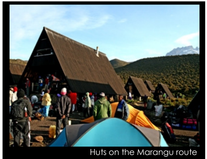
Huts on the Marangu route

On the Marangu route you will overnight in basic huts. The campsite areas make the most of the available terrain, with some having precarious 'drops' for the unsuspecting hiker. It will be a good idea to familiarize yourself with each campsite especially with the location of the toilets before it gets dark. The "long drop" toilets are located outside the huts, so make sure you know where they are, AND how to get back to your own hut... you don't want to spend the night walking around in the cold