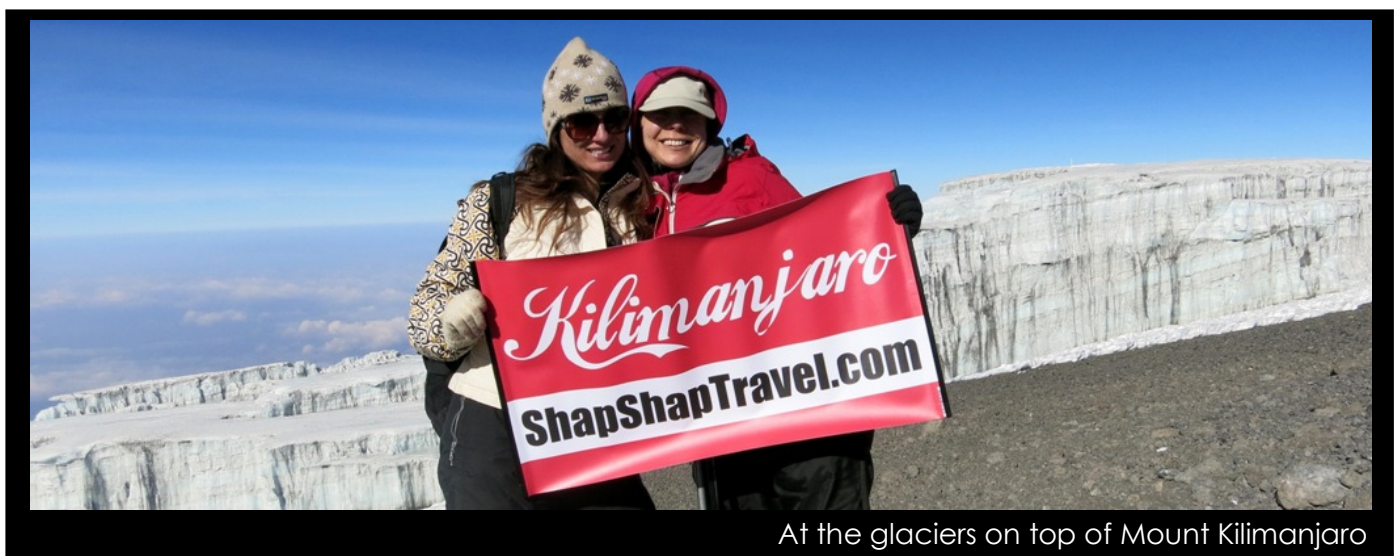
At the glaciers on top of Mount Kilimanjaro

You will need a lot of information to prepare yourself for a great Kilimanjaro adventure. In this booklet you will find lots of useful and important information, so please read it carefully. Here you will find a route description, a suggested packing list, information on fitness and some useful tips and answers to frequently asked questions.