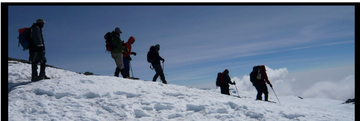
Japie van Deventer and Lizza Duijverman (owners of the ShapShap Travel Group), descending Mount Kilimanjaro after successfully reaching the summit on July 4, 2008!